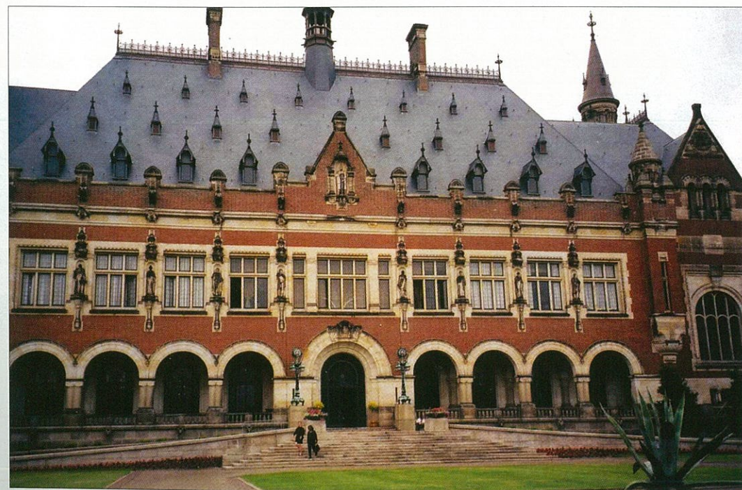
The Peace Palace in The Hague held the 2003 swearing-in of the ICC's first chief prosecutor.

The delegations from 160 countries present at the conference had just twenty-five working days to resolve many still-disputed issues in the consolidated text. Although there was agreement on many components of the draft document, I was astounded to learn that decisions still had to be made regarding 1,700 words, phrases and optional clauses. Every document and any change had to be translated into the six official languages of the Conference — Arabic, Chinese, English, French, Russian and Spanish — and all had to agree in meaning. The Drafting Committee seemed to be in almost constant motion. Even with assistance by more than fourteen agencies of the U.N. and 80 translators, many of them working through the night, it still wasn't sufficient to deal with the massive quantity of work generated by the discussions, decisions and constantly altered texts. So,